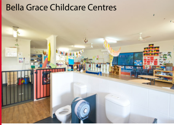
Bella Grace Childcare Centres

Engaging Interesting and friendly designs encourage interaction and learning.