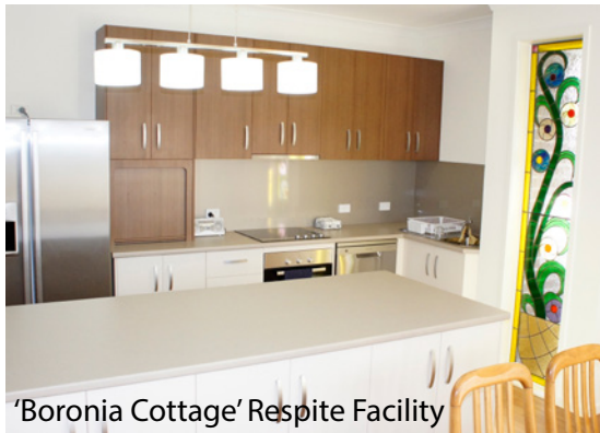
'Boronia Cottage' Respite Facility

Comfortable Thoughtful designs that suit the community as well as the individual, promoting health and well-being.