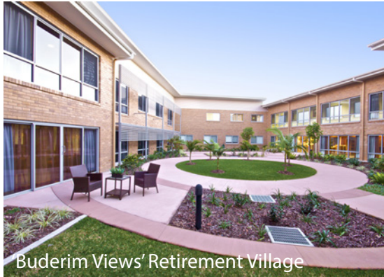
Buderim Views' Retirement Village

Contents: Bella Grace Childcare Centre, Brightwater Bella Grace Childcare Centre, Sippy Downs Boronia Cottage Respite Facility Buderim Views Retirement Village IRT Woodlands Aged Care Village Sunshine Coast Animal Refuge