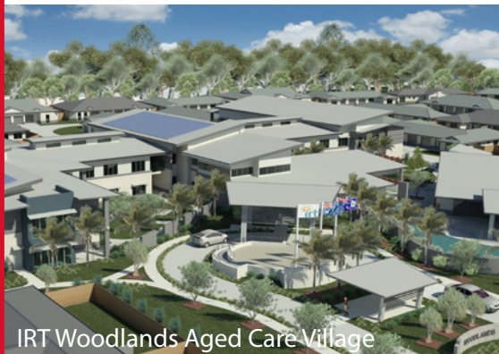
IRT Woodlands Aged Care Village

Practical Effectively planned spaces to suit specialised programs.