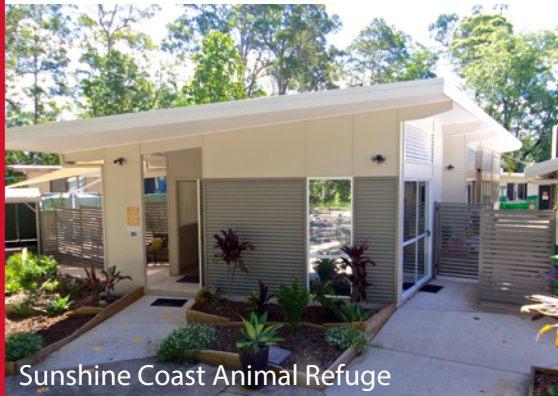
Sunshine Coast Animal Refuge

Efficient Sustainability principles and innovation adopted in the design process provide cost-effective and sensible solutions to high operation developments.